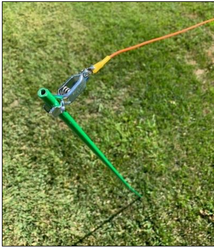
Figures 7-8: Elevated radial deployment with radial clip and 20M SWR measurement.