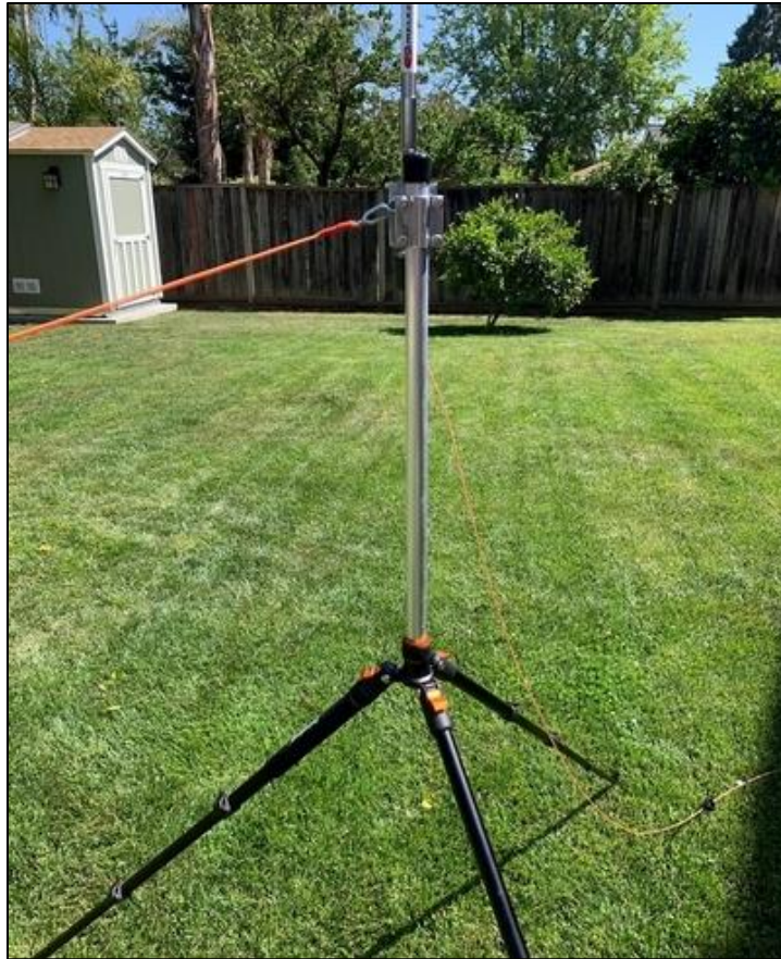
Figures 5-6: Antenna deployment showing system configuration with radial clips.